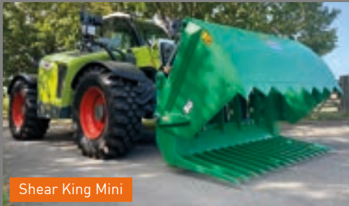
Shear King Mini