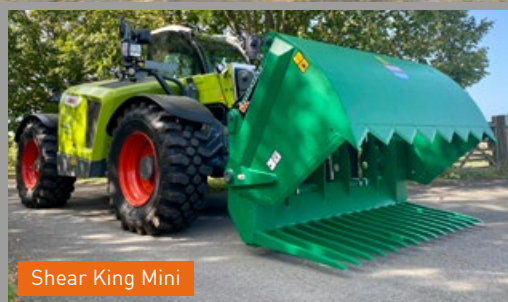
Shear King Mini