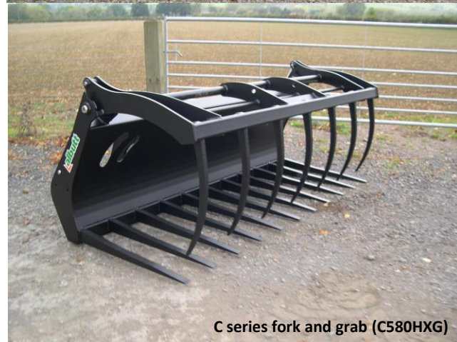
C series fork and grab (C580HXG)