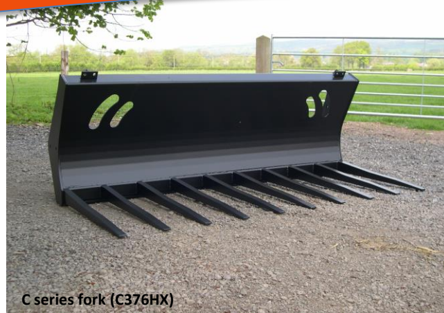
C series fork (C376HX)

Add 'G' to any part number for Grapple Replace '3' in part no. with '5' and add 'G' for Hardox Grab