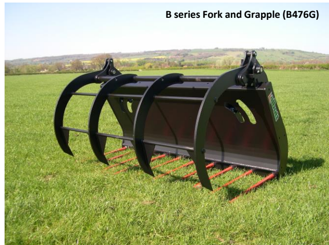
B series Fork and Grapple (B476G)