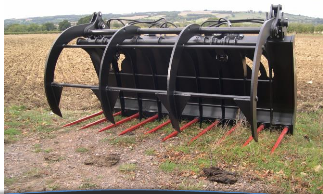
B series Fork and Grapple with Flick Off (B476GFL)

Add 'G' to any part number for a Grapple Add 'FL' to any part number for Flick Off Add 'GFL' to any part number for Grapple and Flick Off